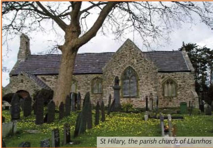
St Hilary, the parish church of Llanrhos

In Llanrhos the church is very involved in our Church Aided School – Ysgol Bodafon – where an After School Club is held every Monday in term time. More recently a new children's club – Hope – has been set up in Deganwy using the Sea Cadet Rooms next to the church, and they even met on Christmas Day!