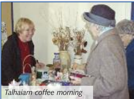
Talhaiarn coffee morning

St Mary's Church, Llanfair Talhaiarn held a coffee morning on 23rd November to raise money to send sixty Ugandan orphanage children and their volunteer teachers to a hotel for their Christmas dinner. The coffee morning aimed to raise £250, the cost of the lunch; the final total, however, was £700. "An excellent achievement - thank you to everyone!"